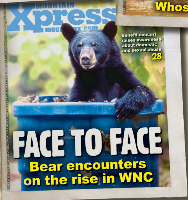
Vol. 29, No. 45 June 7-13