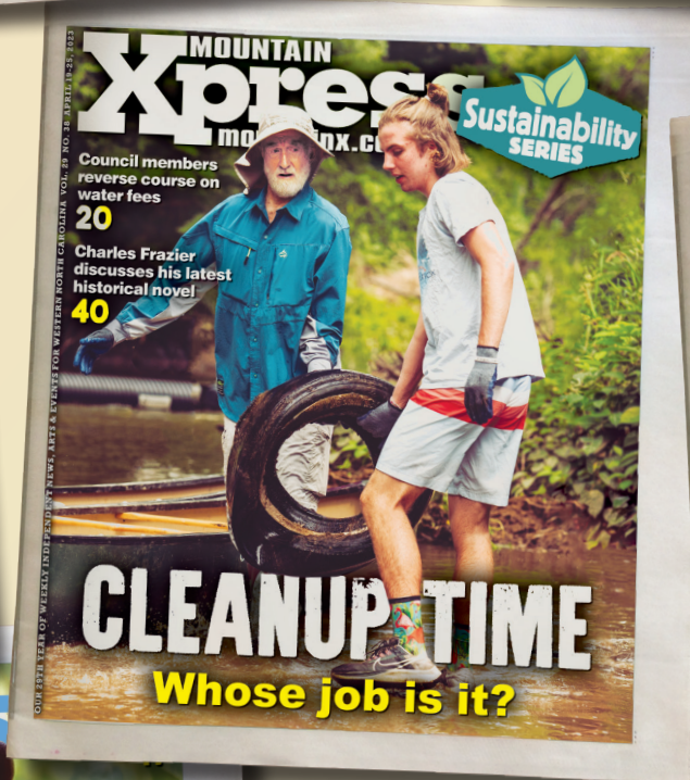
Vol. 29, No. 38 April 19-25