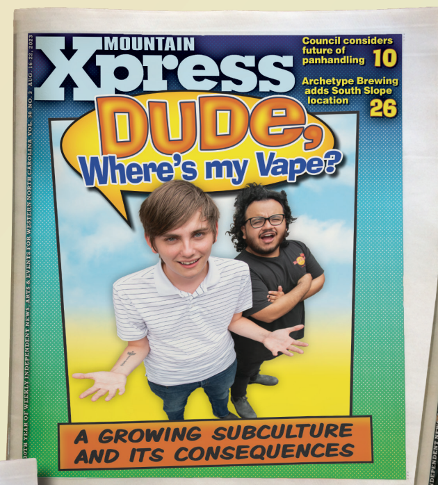
Vol. 30, No. 3 Aug. 16-22