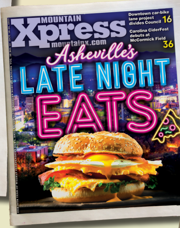
Vol. 30, No. 12 Oct. 18-24