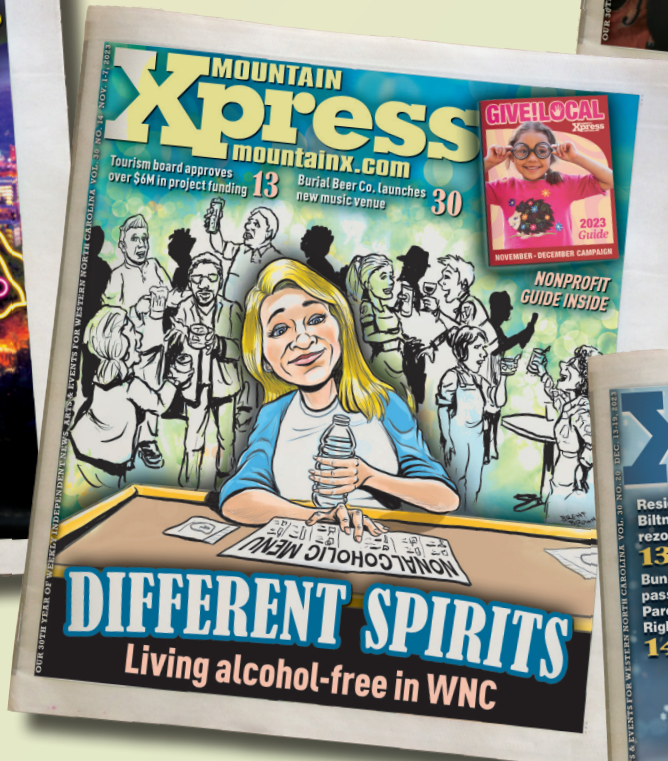
Vol. 30, No. 14 Nov. 1-7